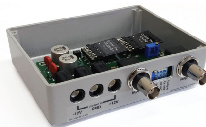
The CR-160-R7 board inside the CR-160-BOX-R3 housing (lid not shown).

The CR-160-R7 comes with the parts shown above. The connectors are supplied unassembled to the board in order to allow the user greater flexibility in their implementation. If the connectors are in fact assembled to the CR-160-R7 board, one may consider installing the assembled board into the CR-160-BOX-R3 housing (as is shown in the figures below). The CR-160-BOX-R3 housing is sold separately. More information on the CR-160-BOX-R3 housing can be found at our web site: http://www.cremat.com/CR-160-BOX-R3.pdf Note: previous versions of the CR-160 (e.g. R6) used a different box layout.